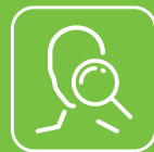
Touchless for Better Hygiene