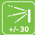
Wide Pose Angle Acceptance