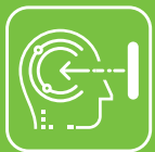
Proactive Facial Recognition