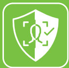
New Height of Anti-Spoofing